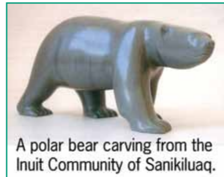
A polar bear carving from the Inuit Community of Sanikiluaq.