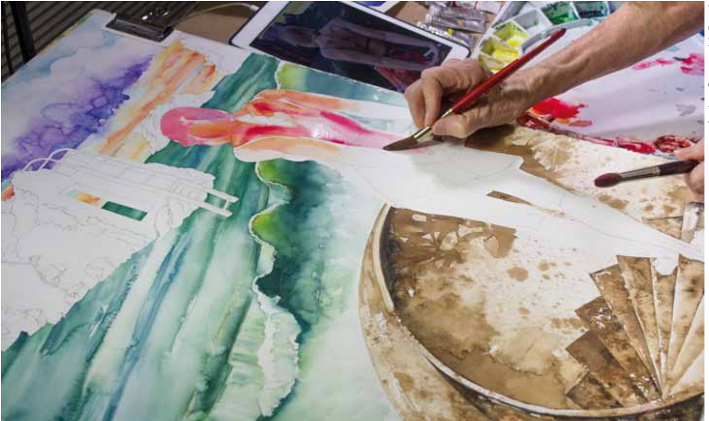
Amber Stone with Brush

Stonehenge Aqua watercolour paper has evolved after several years of collaboration with paper mills and artists to create a high-performing, cost-effective paper for watercolourists that will exceed their expectations. This 300gsm, 100% cotton paper is available in standard 56x76cm (22x30") sheets and a selection of blocks (glued 2 sides) in both cold-press and hot-press finishes. It is acid and chlorine free and features the same surface on both sides of this buckle-resistant, professional "crisp" feel paper.