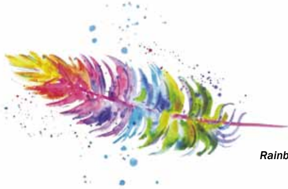
Rainbow Feather

Yupo Ultra is a unique alternative to traditional art papers. It is a synthetic paper, made of 100% polypropylene and is waterproof, stain resistant, and extremely strong and durable. It features a non-absorbent, ultra-smooth surface that resists tearing and buckling and remains perfectly flat, eliminating the need for soaking, stretching or taping. The non-absorbent surface allows watercolours and acrylics to sit right on top of the paper, providing beautiful, watery affects that are unachievable on any other paper. Pigments applied to the ultra-white sheet retain their true clarity and brilliance making the colours more vibrant and brilliant than standard papers. Yupo synthetic paper can withstand multiple erasures and it can even be run under a tap to erase watercolours. It also holds pen and ink lines with razor sharp precision and markers work beautifully on the unique surface as well. It is also ideal for silkscreen printing, drawing and offset printing. Due the unique qualities of this paper, dirt and oils can hinder its performance so it is recommended that any spots and/or fingerprints be removed with soap and water before use. Yupo ultra-smooth synthetic paper is pH neutral, flawlessly smooth and recyclable.